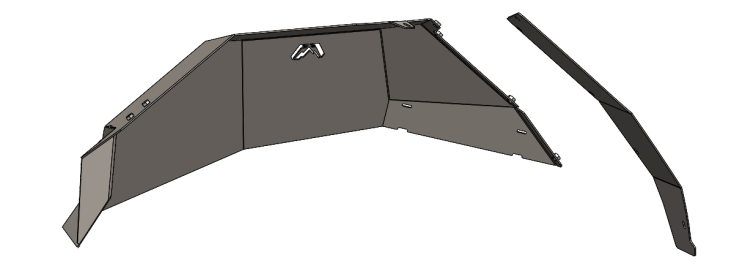
Exploded View - Driver's Side