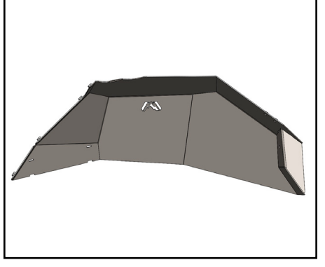
22970 - DS Inner Fender