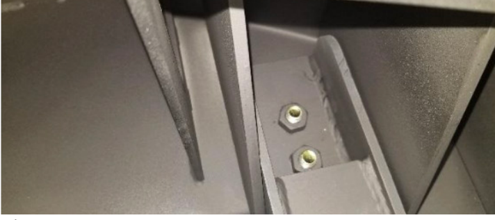
Figure 4 Figure 5