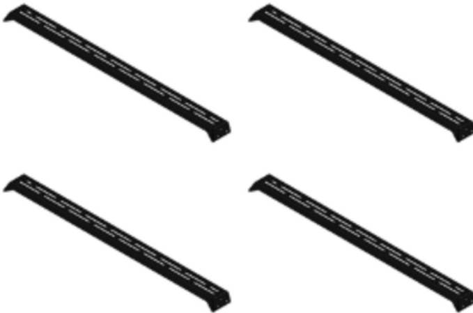
23396 - CROSSBARS (QTY:4)