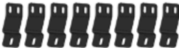
23397 - MOUNTS (QTY:8)