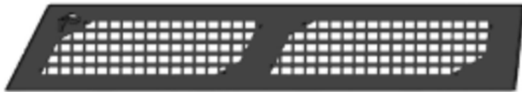
23395 - PS MOLLE PANEL